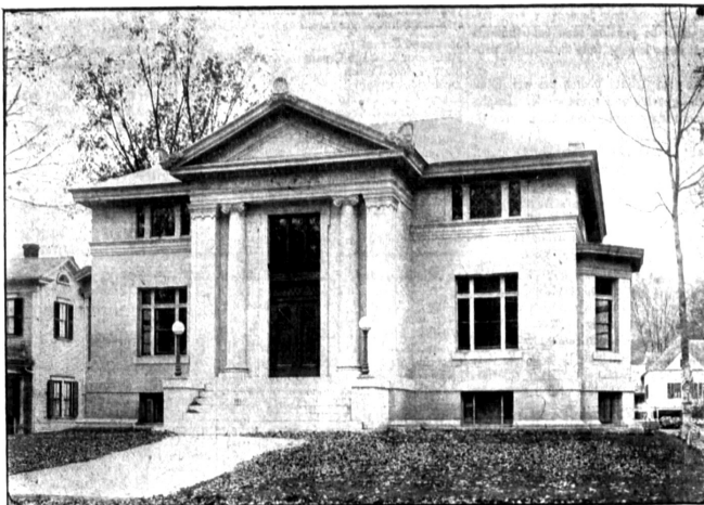
The New Rockingham Free Public Library Building.

A Red Letter Day in the History of the Town—Building and Grounds Cost Over $20,000—Andrew Carnegie Gave $15,000—A Detailed Description of the New Library Home.